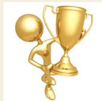
BATTLE OF CHAMPS January 18-20 Toledo